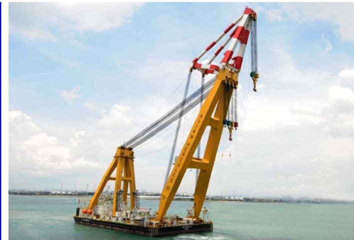
ASIAN HERCULES III 5000 MT SEAGOING FLOATING SHEERLEG CRANE

Name Asian Hercules III Flag Singapore Port of Registration Singapore Callsign 9V2514 Built Keppel Nantong Class ABS A1, + AMS E - Heavy Lift Vessel